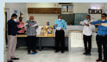
Constitution Day Celebration