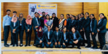
Be a Path Finder