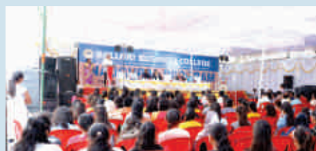
An auspicious start to the new Academic Year