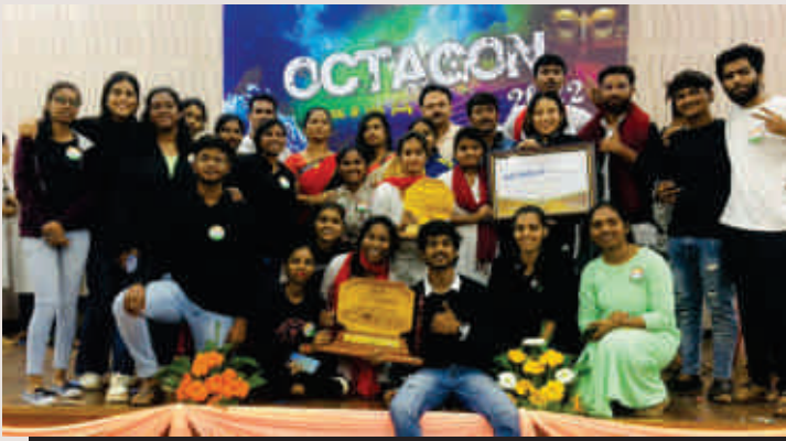
Winning Moments at National Level Fest, OCTAGON, at BAPUJI College, Davanagere.