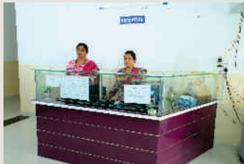
Reception Desk at Girls' Hostel