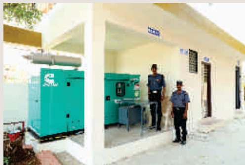
Round-the-Clock Power Back-up