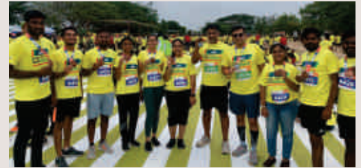
Participants of JSW BALLARI CITY Steel City - 10K Run