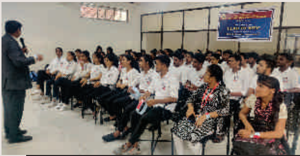
LEAD TO WIN (HR)