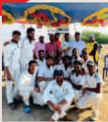
University runners up in cricket