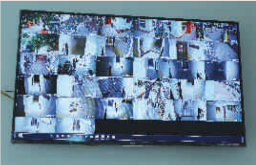
Closed Circuit TV Surveillance