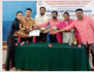
VSK UNIVERSITY- inter-collegiate championship Winners