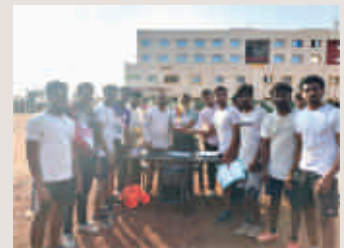
Winners of university Handball tournament