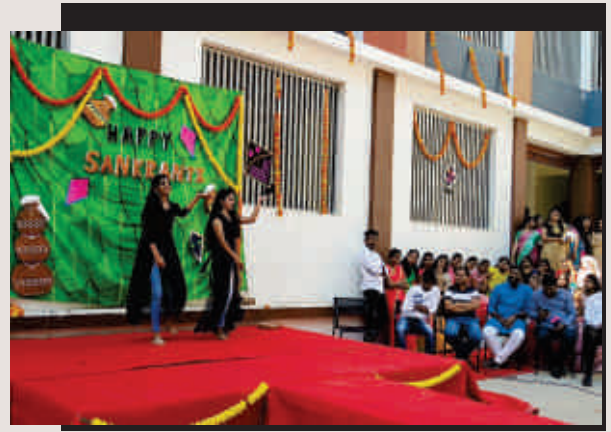
Ethnic Day Program