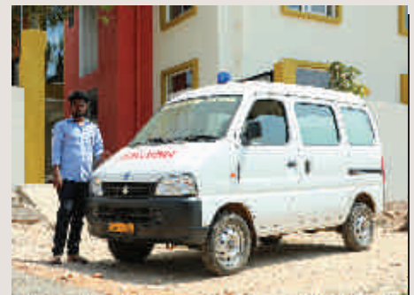
Medical Assistance & Ambulance