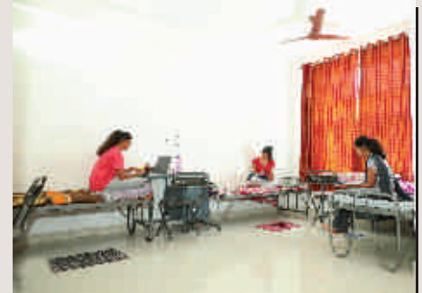
Hostel Room with attached Bath