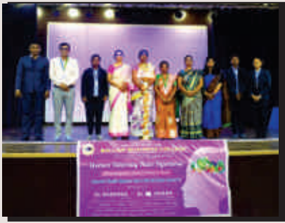
Health and Hygiene