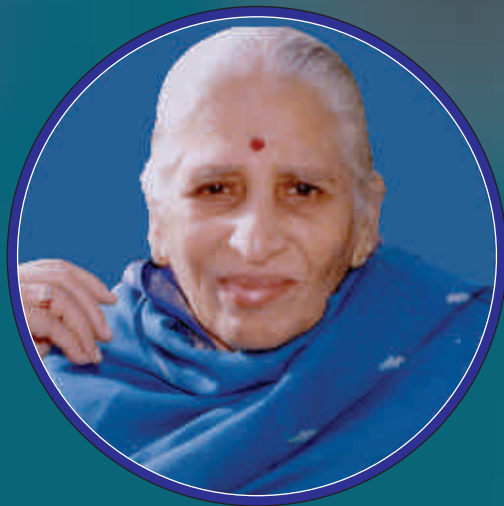
Founder Chairperson Late Smt. Basavarajeswari Former Union Minister