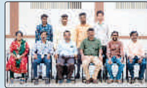
Staff of the Administration Office - The Foot Soldiers of BBC