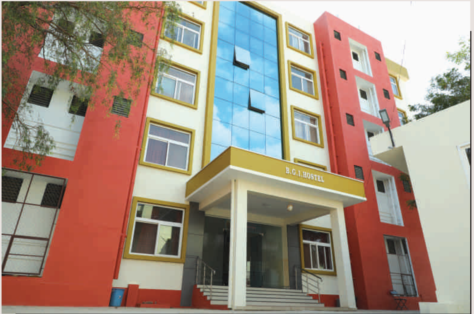
The modern and well-equipped Hostel Building