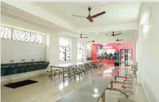
Hygienic Dining Hall