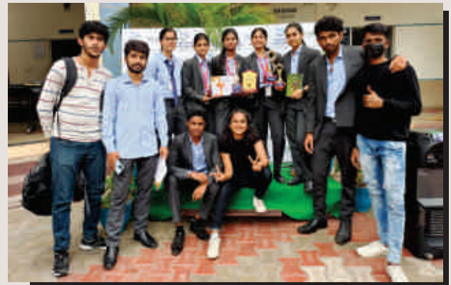
Bitsava - Winners of Vocal Pandits, Exquisite, Dance crewz, Kiss (special prize)