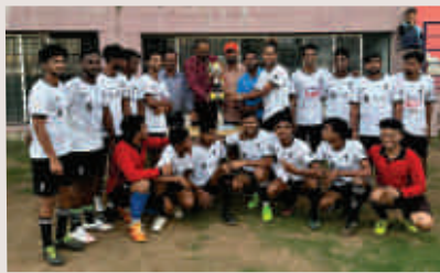
University Runners up in Football tournament