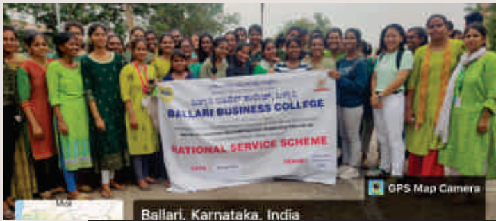
Ballari, Karnataka, India