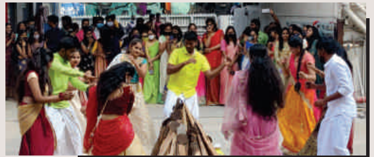
Celebration of Sankranti Festival